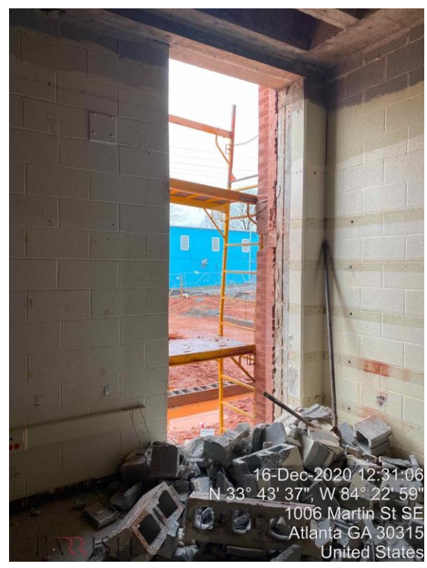
New handicap accessible opening